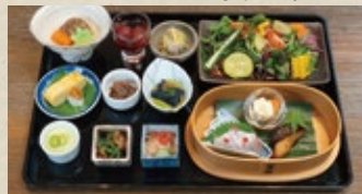
Iroha Set Meal - いろは御膳 - 16 Dishes in Total 2,750 yen