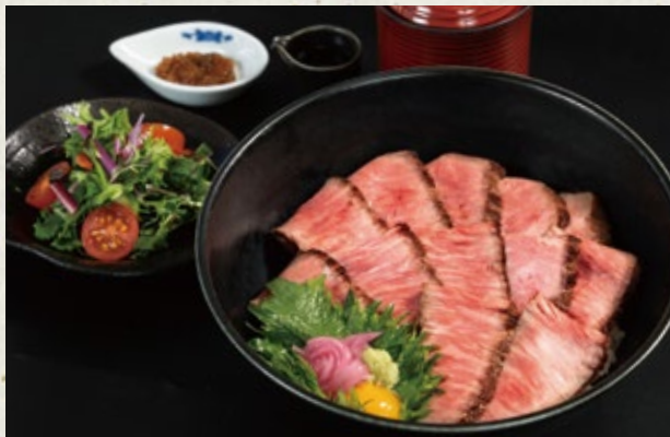
Miyazaki Beef Roast Beef Bowl - Japanese Artisan Style