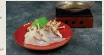
Seasonal fish broth shabu-shabu