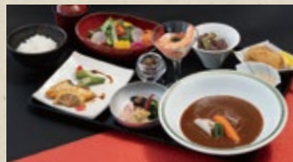
Ozaki Beef Stew Set Meal 10 Dishes in Total 2,970 yen