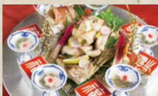
Celebration Plan - 景福 - 9 Dishes in Total 11,000 yen