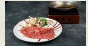
Ozaki beef broth shabu