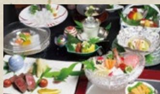
RAN - 蘭 - 9 Dishes in Total 14,300 yen