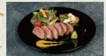
Miyazaki beef roast beef