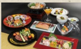
YURI - 百合 - 9 Dishes in Total 9,900 yen