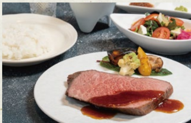
Miyazaki Beef Roast Beef - Japanese Artisan Style