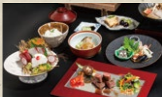
BOTAN - 牡丹 - 7 Dishes in Total 6,600 yen