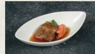
Ozaki beef Kyoto-style stew