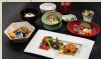
YANAGI - 柳 - 7 Dishes in Total 3,850 yen