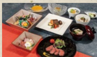
HAGI - 萩 - 9 Dishes in Total 7,700 yen