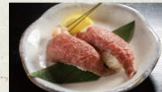
Ozaki beef sushi