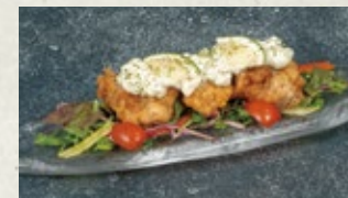
Miyazaki specialty Chicken Nanban